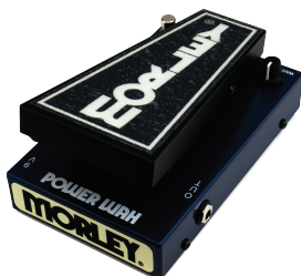
20/20 POWER WAH (Model MTPWO)