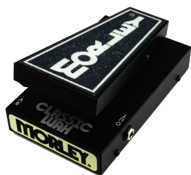
20/20 CLASSIC WAH (Model MTC5W)