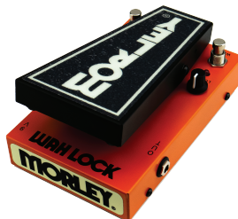
20/20 LEAD WAH (Model MTLW)