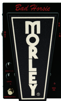
BAD HORSIE 2 CLASSIC SIZE (Model BH2)